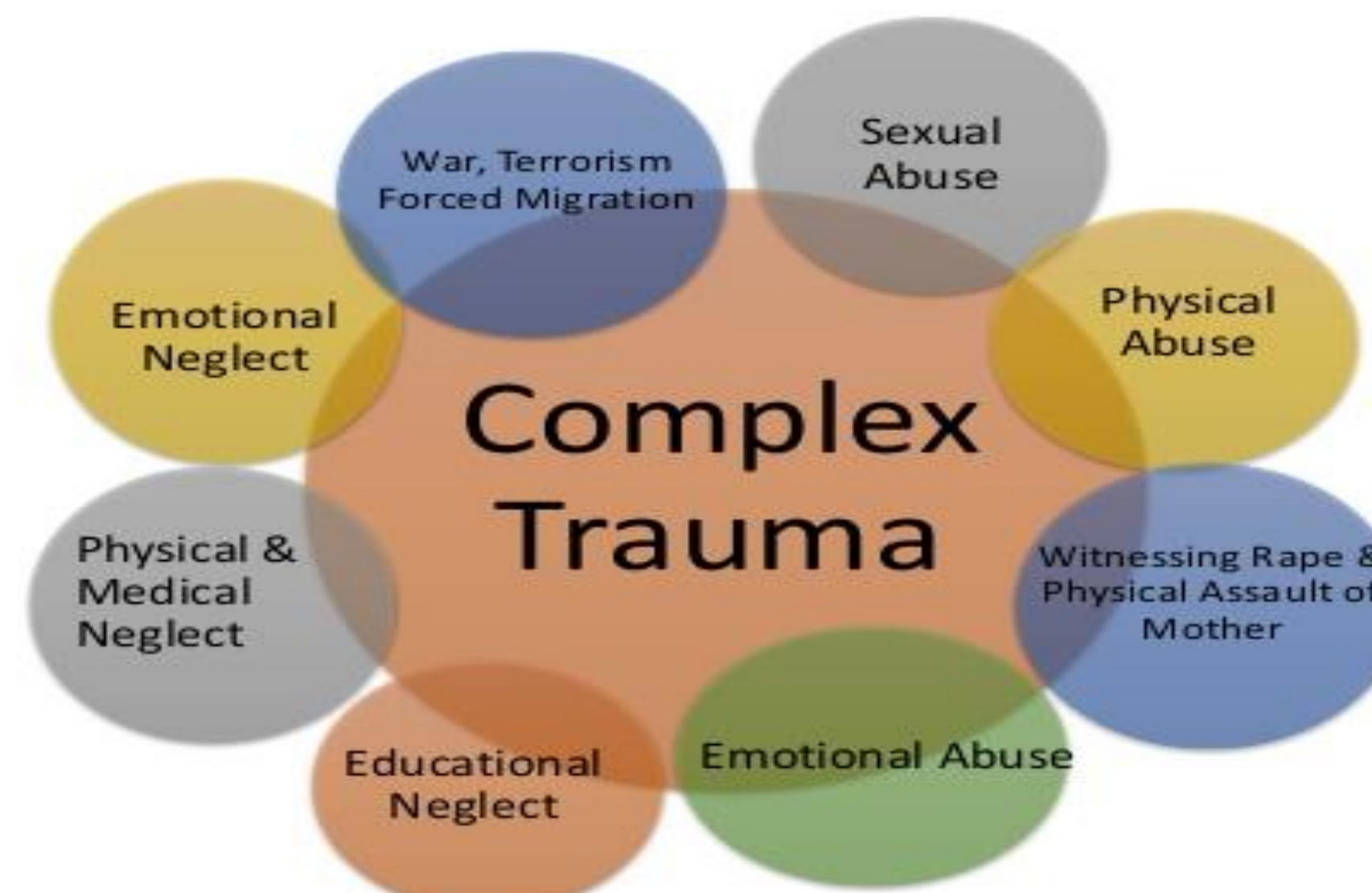
Figure 1. Label in 36pt Arial

Click once on the dashed border to highlight then drag the bottom edge up to fit. Or change the font size to fill the box.